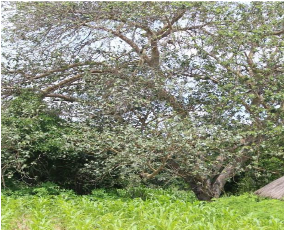
Plate 4: The big fig tree where most functions were performed. (picture by author 04/02/17)

Mbira is a means of communicating with ancestors. If we experience a dry spell or drought, the dance is performed so that we get the rains. Sometimes if there is something wrong done, we played mbira under that big fig tree and those in the heavens could hear us and solve our problems.