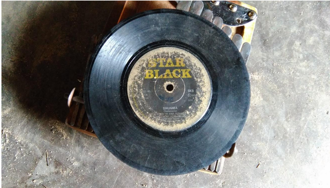
Plate 5. The single Wanyanya recorded in 1969.

struggled to play Nhemamusasa, a mode in which Wanyanya song was recorded.. All the two songs have social commentary.