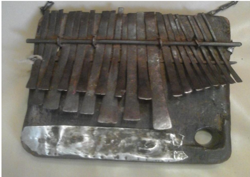
PLATE 3: One of the first set of nhare mbira bought by the Gumira family around late 1950s

The instrument was learnt by most male members of the Gumira family. It was mainly played at their evening dare which usually took place under a big mukuyu tree (plate 4 ). It was under this big mukuyu tree that most family traditional functions such as mapira and mafuwe were performed. Solomon and Musafare made an effort to acquire a set of 2 new Nhare Mbiras in the late 1950s. One of these mbiras still exists today.