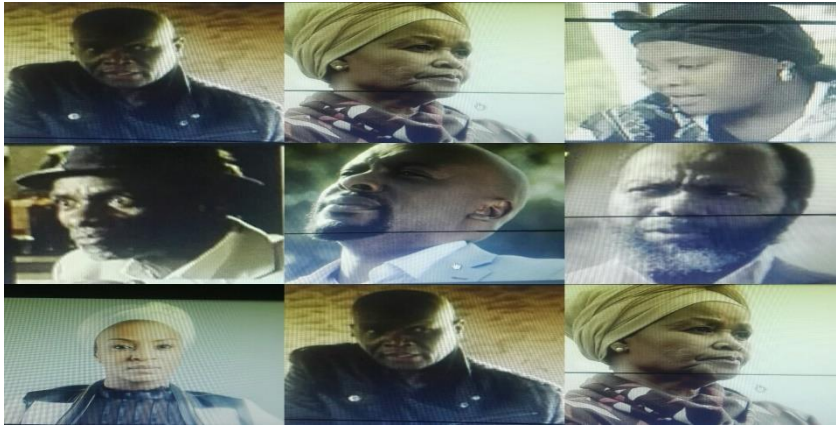
Fig 1.5 shows the members of the Chief's council in Bhubesini.

Media representations of women, professionals and leaders are either absent, gendered, sexualized and often communicate contradictory messages. The media place maximum focus on hair, clothes, weight and children, therefore questioning the competence to serve in senior roles. In Isibaya, though Siphokazi has assumed the position of the chairperson of the Chief's council, the society constantly refers back to her chain smoking habits to discredit her ability to lead a community. In the same vein, Iris is reminded of her ordeal with the Zungus, whereby he slept with Zungu and his son, thus they do not award her respect as a businesswoman. This shows the relationship between the media and women and how it reveals the struggle that women have engaged in and their use of media to gain a 'public voice, presence and influence'.