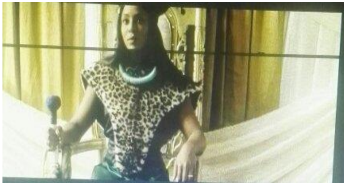
Fig 1.7 shows the inauguration of Qondi as the regent of Bhubesini.

The researcher singled out examples of situations where women have risen to be active participants in the positive public sphere. The researcher observed a paradigm shift in the African culture as women are now challenging patriarchy especially in issues concerning adultery and polygamy. A typical African woman is expected to support her husband’s decision if he decides to take another wife. In episode 831 Thandeka Zungu files for a divorce when her husband takes another wife, following her refusal to have babies and choosing to focus on her career: